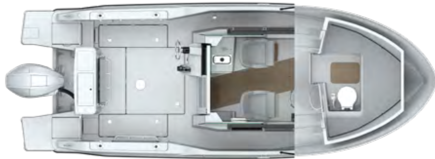
Upper / Lower Deck