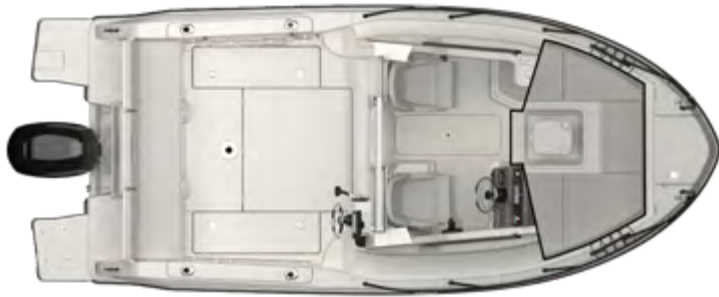
Upper / Lower Deck