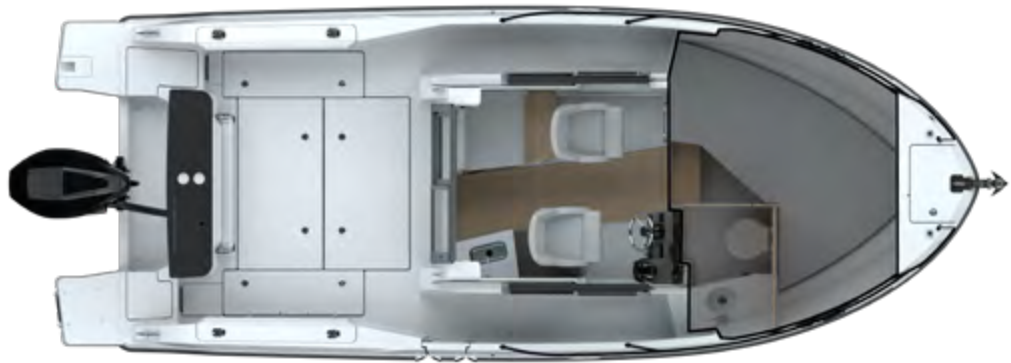
Upper / Lower Deck